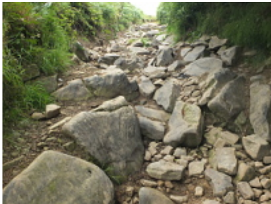
The steps on Limer Rake. Photograph July 2015

It is worrying that the route has got to such a state that even off roading organisations are advising members to consider whether they have the vehicle or skills to cope with the route.