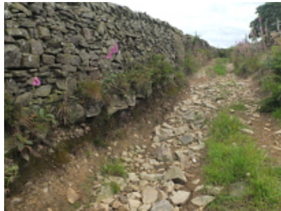
Foundations of walls being undermined. Photograph July 2015

The route is continuing to deteriorate and walls are becoming more and more undermined and hence potentially dangerous to all users. The depth and width of the rut in the section of Swan Rake below the junction with Limer Rake has increased. We expressed our concern to the PDNPA ARP committee (which deals with off-roading matters) that Swan Rake and Limer Rake were not included in its 2015-2016 Action Plan. This new incident, where walls are being damaged to make passage easier for recreational motor vehicles, only strengthens our argument that Traffic Regulation Orders (TROs) are needed urgently on the Hollinsclough Rakes.