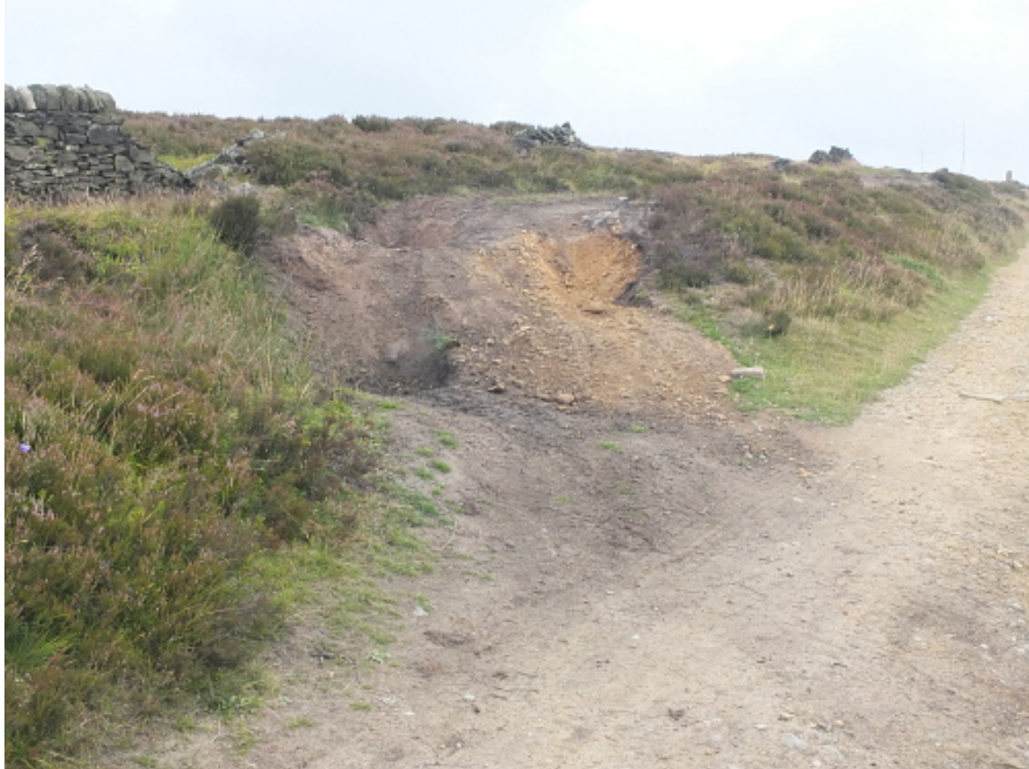
The same area in August 2015. Visible damage has increased

SCC have said that boulders will be placed to stop access to this area soon. Because this area is part of the Eastern Moors SSSI, Natural England has to agree to any work and work can only be carried out when it won't disturb nesting birds.