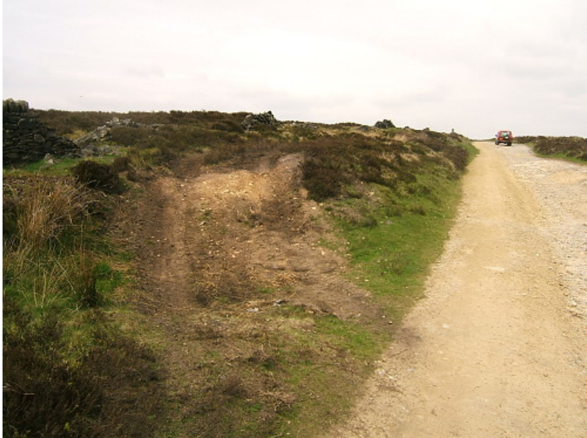
Off piste damage in May 2014

Houndkirk Road is a disused turnpike road going from the A6187 across Houndkirk Moor to a minor road at Ringinglow. It is now a BOAT and can be legally used by 4 x4s and motor bikes.