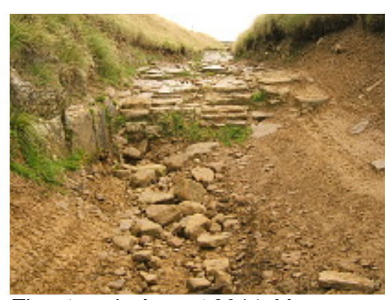
The steps in August 2014. Many users found these difficult to use and an alternative path had been created on the bank above the steps (on the right hand side of this photo – but not shown in the photo).

It has been closed to all users from the junction with Edale Footpath 2 (SK 100835) to the junction with Sheffield Road (Rushup Edge) by Derbyshire County Council Temporary Traffic Regulation Orders (TTROs) since at least 11 December 2014 (and probably from October 2014 or earlier) for repairs.