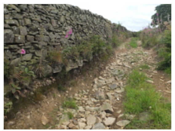
Limer Rake: Wall footings undermined. July 2015

Hollinsclough resident can remember being able to canter up Limer Rake (which then had a grassy surface) on her horse. Before the closure, very few horse riders would care to ride up either Rake because of the poor surface condition. Many walkers and cyclists also found the surface difficult.