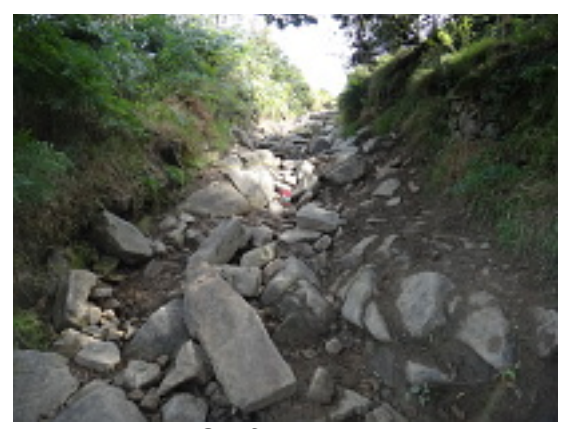
Limer Rake: Surface damage. August 2016

Unfortunately there were still no signs or notices on the route to advise of the closure and the boulders which were going to be placed to stop entry to the routes were not in place in early July. If users are not made aware of the TTRO when they reach the route, there is no chance of it being observed.