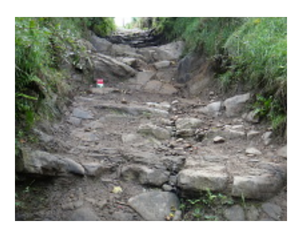
Photograph: The steps on Swan Rake. The small red object is an OS Map to give an idea of the size of the step. August 2016.

Unfortunately there were still no signs or notices on the route to advise of the closure and the boulders which were going to be placed to stop entry to the routes were not in place in early July. If users are not made aware of the TTRO when they reach the route, there is no chance of it being observed.